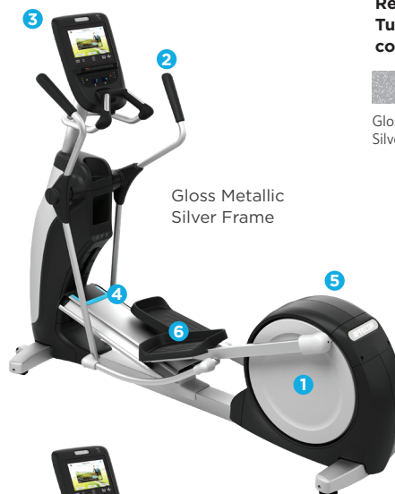
Gloss Metallic Silver Frame

The low step-up height improves accessibility and the optimized pedal spacing provides a more natural and comfortable feel.