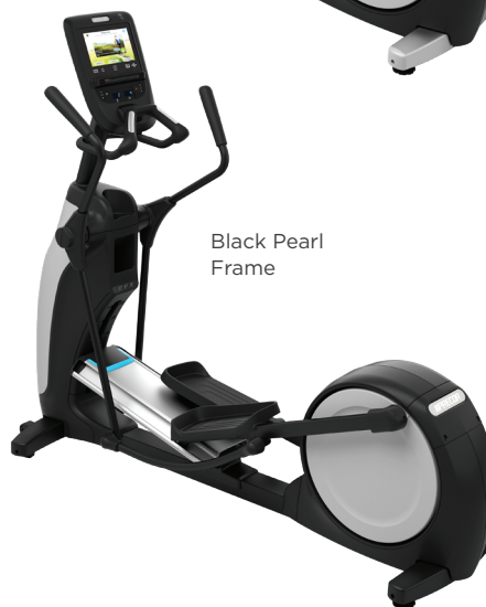
Black Pearl Frame

Refined colorways with dark Tungsten covers and two frame color options.